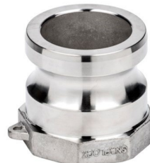
nerezová ocel AISI 316