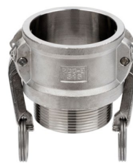
nerezová ocel AISI 316