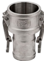
nerezová ocel AISI 316